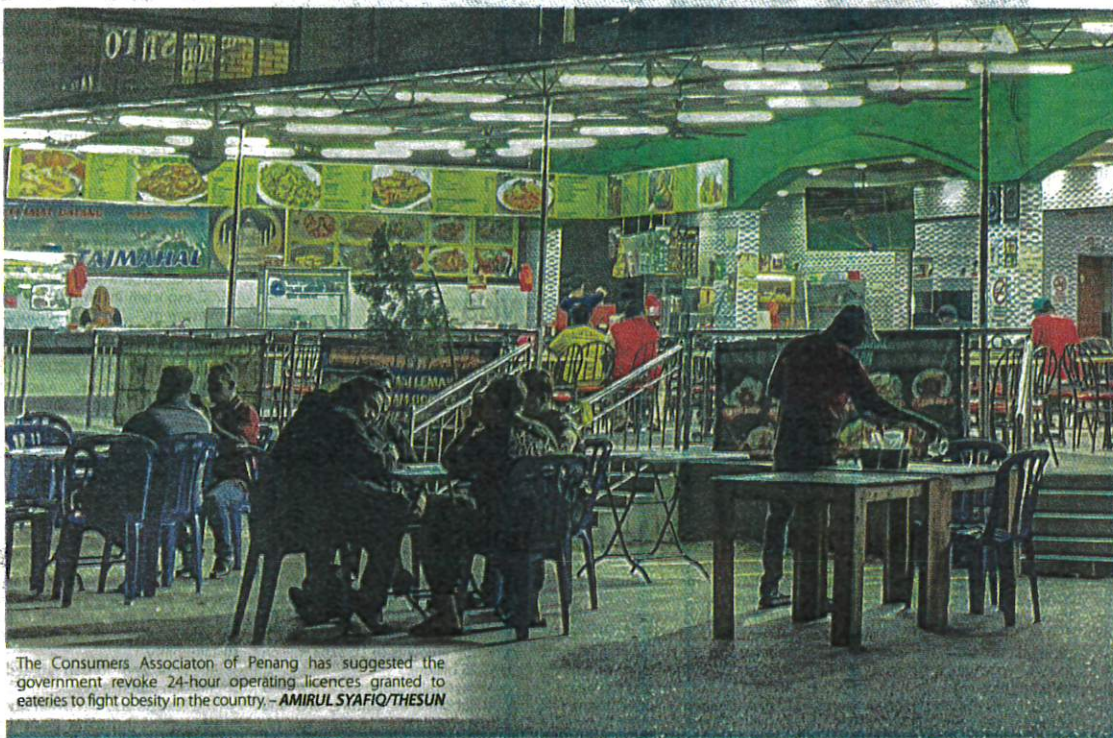
The Consumers Association of Penang has suggested the government revoke 24-hour operating licences granted to eateries to fight obesity in the country.