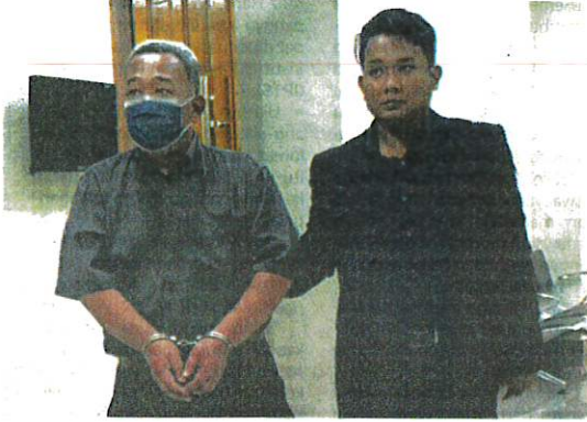
TERTUDUH (kiri) dibawa keluar dari mahkamah selepas dijatuhkan hukuman denda RM3,000 di Mahkamah Sesyen Kuantan semalam.

AKHBAR : KOSMO MUKA SURAT : 8 RUANGAN : NEGARA